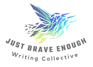
Just Brave Enough www.JustBraveEnough.com